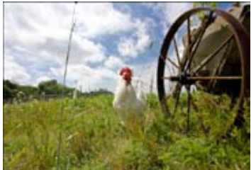
Ellen Watson Amber Waves Chicken Archival digital print, 14" by 18", $475 www.EJWatson.com