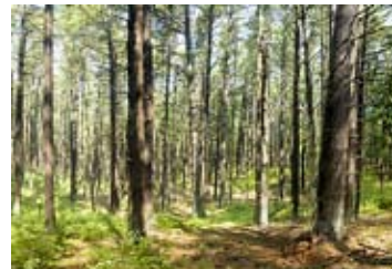
Tome Steele Wilson's Grove Photograph, 40" by 60", $4,800 www.TomSteeleStudio.com