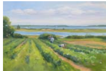
Susan D'Alessio Rhubarb Fields at Latham Farm Oil on canvas, 48" by 72", $4,900 www.SusanDAlessio.com