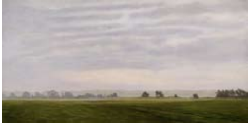
Eileen Dawn Skretch Highland Terrace Sunrise Oil on wood, 36" by 72", $7,500 www.EileenDawnSkretch.com