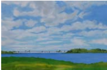
Casey Chalem Anderson Dam Pond - North Fork Oil on canvas, 48" by 72", $6,400 www.CaseyArt.com