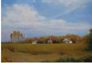
Aubrey Grainger East End Farm Oil on canvas, 40" by 60", $4,800 www.AubreyGraingerStudio.com

Once again, the painters and photographers of Plein Air Peconic will be displaying works of conserved landscapes in the barn at Through Farms & Fields. Please spend some time enjoying these beautiful works that represent the conservation work of the Trust. All artwork is available for purchase, with a percentage of the sale being donated to the Trust by the artist. Please visit the website for more information: www.PleinAirPeconic.com .