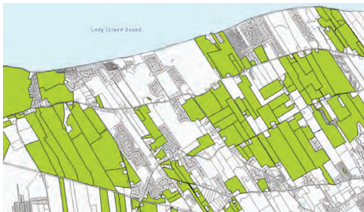
Protected farmland in Riverhead

Jessie Marcus and Matthew Swain— to inventory the remaining unprotected farmland parcels and identify those most critical to conserve; review the Town's TDR code and propose amendments to streamline and strengthen the process; and develop a more transparent application process for both developers and landowners. Once the revised program is in place, we will work with the Town to promote the opportunity. We look forward to sharing the progress over the next year.