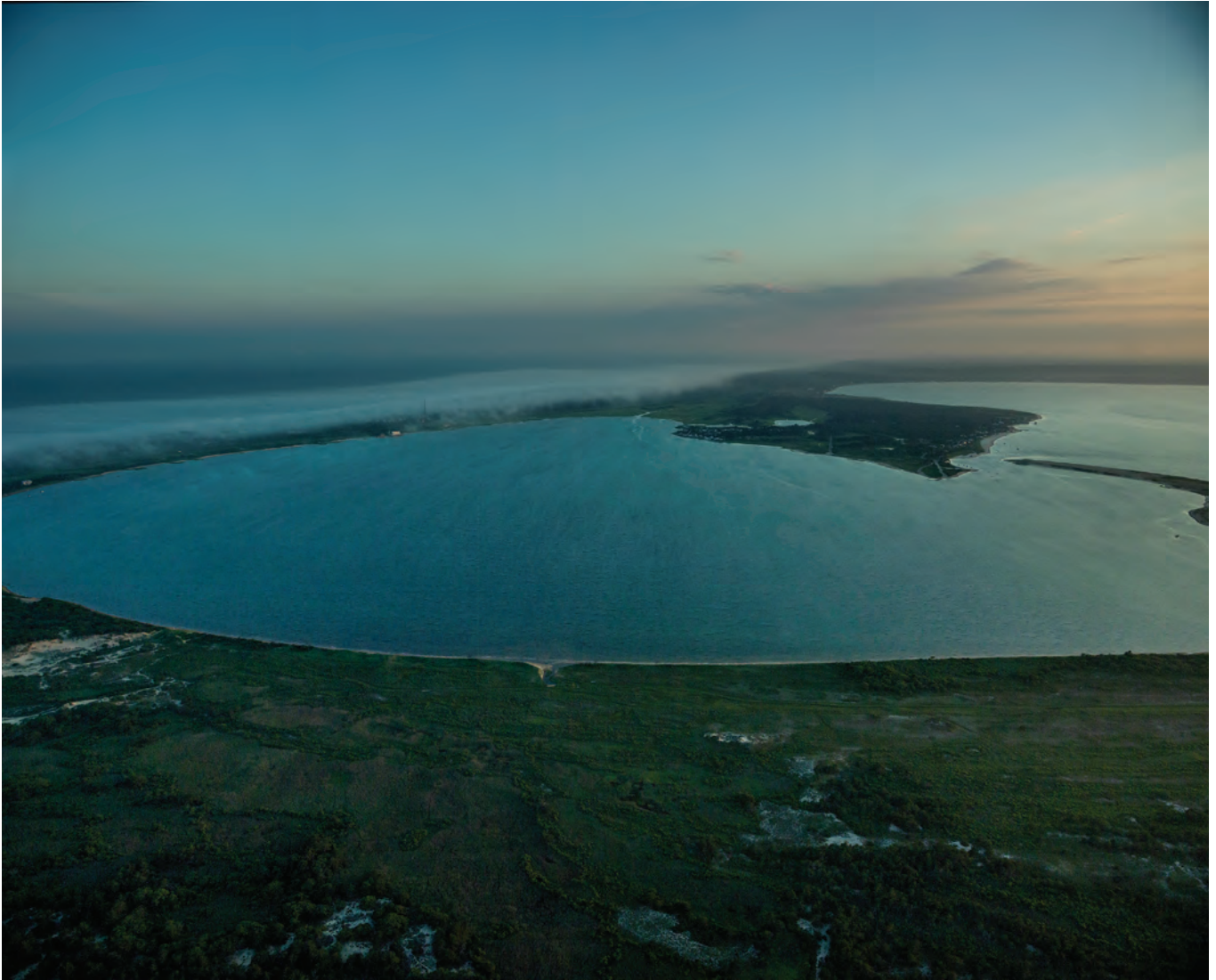
The view across Napeague Harbor toward Lazy Point in East Hampton.

His photographs capture both how much has been developed on the dense northeastern seaboard but surprisingly also how much has been saved amidst the geological wonders of terminal moraines like Long Island and Cape Cod, with the pastoral beauty of the truly exceptional East End agricultural soils revealed. Here is a peek into Mike's view: