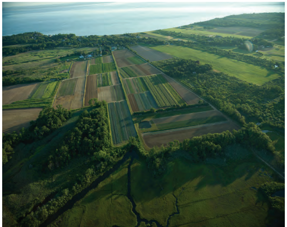
Historic family farms preserved in Orient looking toward Long Island Sound.