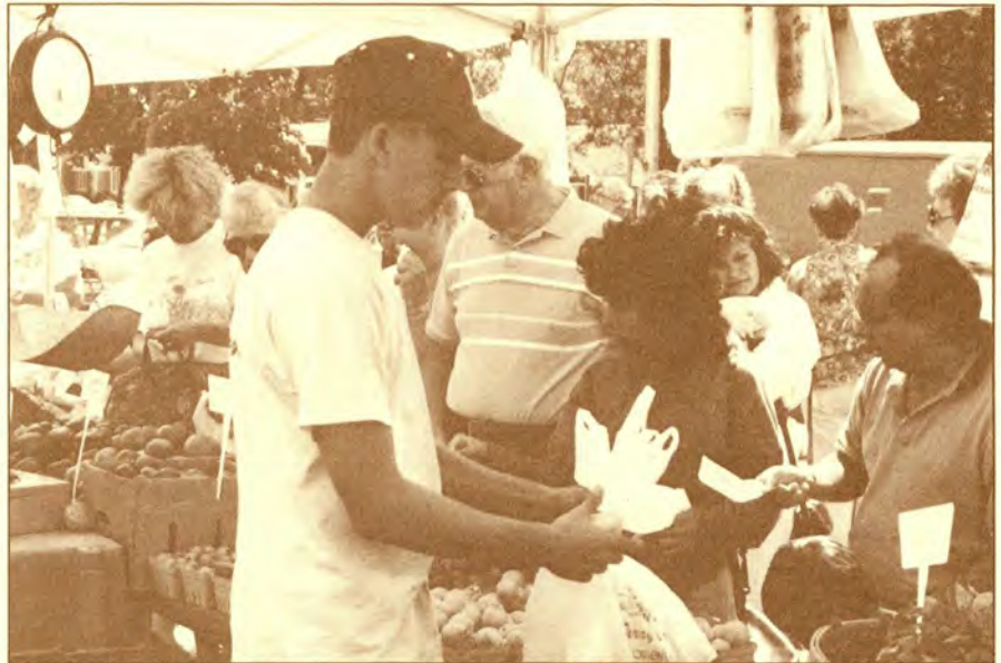
Open-air Long Island Community Markets in Port Jefferson and Islip are attracting residents and visitors interested in fresh, locally grown and harvested foods.

The benefits of Long Island Community Markets are many. The creation of new markets for local farmers helps our regional economy and promotes a food resource for Long Island's citizens. In addition, the markets educate people about the types of locally grown or harvested foods, thereby helping to increase demand for these products. We are also assisting the WIC (Women,