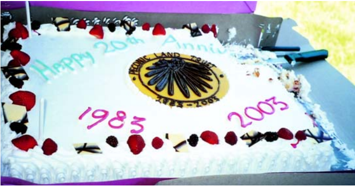
After last Spring's rain, the Trust's annual Peconic was a spectacular, sunny day in the orchard at Quail Hill Farm . . . one of the highlights was a delicious cake.