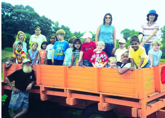
Funded by a grant from the Heckscher Foundation for Children, the Trust's Quail Hill Farm hosted children from the Child Development Center of the Hamptons in a summer program that focused on respect for the land and conservation of our natural resources.