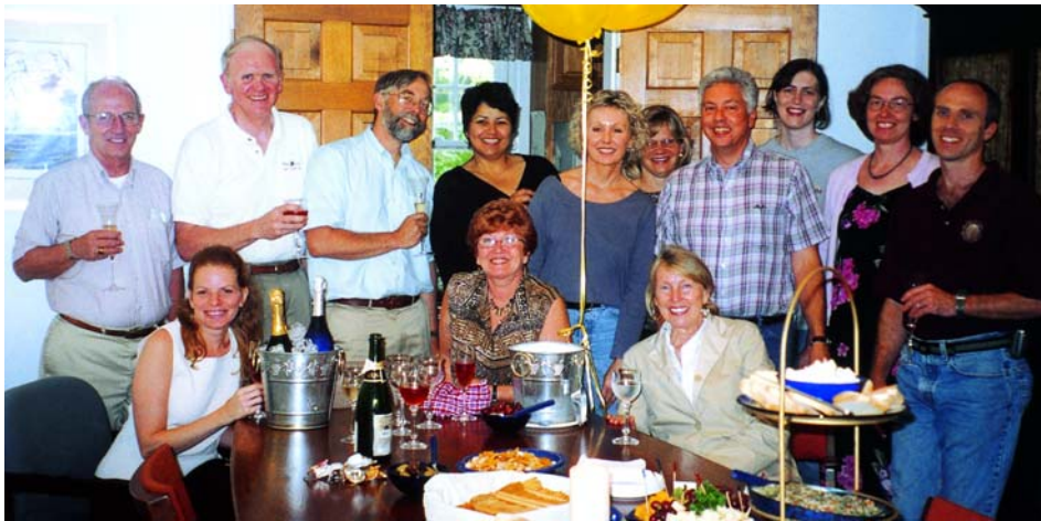
Trust staff observed the organization's 20th anniversary with a Friday afternoon celebration.

has also evolved from 4 founders to 15 conservationists from Eastern Long Island, all who share a deep love of the land and the people who make up our communities.