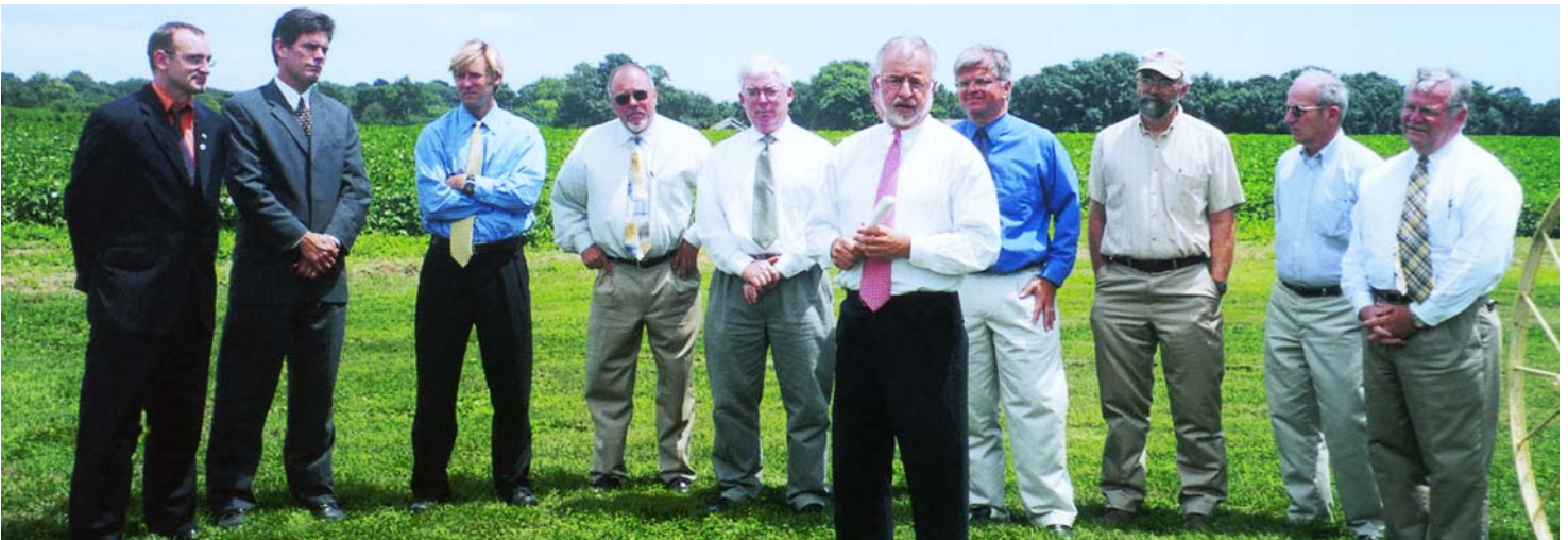
Congressman Timothy Bishop joined state and local officials and environmentalists to announce the legislation he is co-sponsoring that will allow farmers to sell their development rights under an installment payment program.